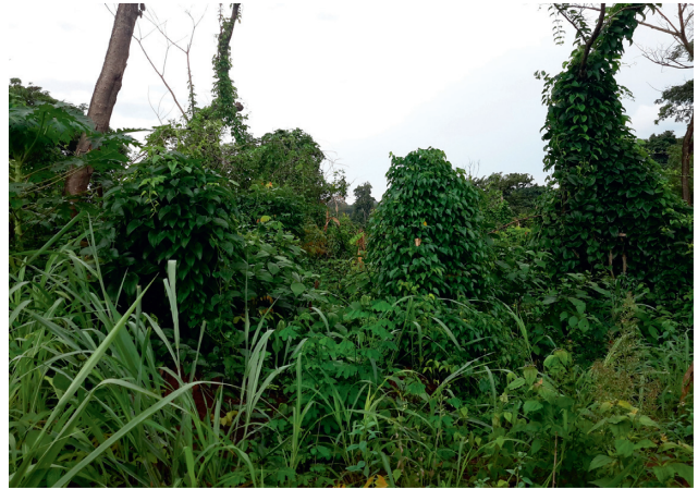
FIGURE 1: A yam farm established on a freshly cleared tertiary forest at Adansam in the Forest-Savannah Transition zone of Ghana. Many of the native shrubs were left to serve as stakes.

2.1. Agroecology. Yam tuber yields are controlled by interactions of several physiological and environmental factors [1]. External environmental factors such as warm weather conditions, the duration of sunlight or photosynthetic active radiation, humidity, rainfall amount, and distribution limit yam production to specific hotspots within the yam belt. These all have implications for the existence of constraints such as environmental stresses and incidence of pests and diseases [11]. The most important product of the yam plant