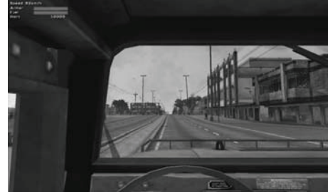
FIGURE 1: Serious gaming environment: low threat zone.

The VE used in both immersion conditions was comprised of a series of low threat and high threat zones in a virtual Iraqi city. In both the high immersion and low immersion conditions, participants experienced the VE from the perspective of the driver of a Humvee. The speed of the vehicle was kept constant as it followed a predefined trajectory to control for time spent in each zone of the VE and to keep that time consistent across participants. Participants were given a basic 10° steering wheel to limit the trajectory, though they were instructed to stay on the road. This allowed for some level of control of the environment without sacrificing experimental control of the stimuli experienced. Low threat zones consisted mainly of a road surrounded by a desert landscape and were free of gunfire and other loud noises (see Figure 1). The high threat zones included improvised explosive devices (IEDs), gunfire, insurgents, and screaming voices (see Figure 2). The