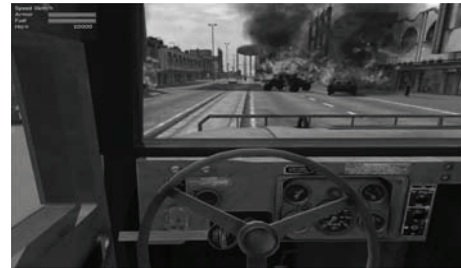
FIGURE 2: Serious gaming environment: high threat zone.

auditory background levels associated with the low threat and high threat zones were identical in both the high and low immersion conditions. Participants passed through three low threat and three high threat zones in an alternating sequence in both immersion conditions. Low threat zones were always experienced first and were used to allow the participant to habituate to the novelty of the virtual environment. High and low threat zones also varied in length, with low threat zones consistently lasting longer than high threat zones. High threat zones averaged 20 seconds in duration, while low threat zones averaged 50 seconds. This was to ensure that zone lengths were not predictable, and so that participants had ample time to return to low levels of responding after experiencing the highly arousing high threat zones. The total length of each run was 210 seconds.