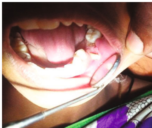
FIGURE 1: Clinical photograph showing a solitary, firm, ulcerative tissue measuring 2 \times 2 centimetres on the alveolar mucosa near the premolar region.

2.4. Differential Diagnosis and Its Consideration. Verrucous carcinoma has particular clinical and histopathological features that agree its diagnosis to be obtained, which was an uncharacteristic observation in the present case. First, the clinical reasons for rejection were considered followed by the histological ones for each diagnosis, to obtain a final diagnosis thus clearly separating from others. Oral traumatic fibroma was ruled out since it presents as a firm smooth papule in the mouth, usually the same colour as the rest of the mouth lining, but is sometimes paler or, if it has bled, may