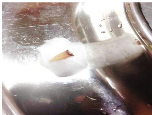
FIGURE 3: Clinical photograph showing a completely removed tooth under local anaesthesia.

look a dark colour. The surface may be ulcerated due to trauma or become rough and scaly. It is usually dome-shaped but may be on a short stalk like a polyp or pedunculated [6]. It should be noted no histological dysplastic features and other observations are not present and fibromas