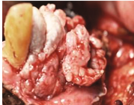
FIGURE 5: Clinical image showing a wide local surgical excision performed under local anaesthesia.

Verrucous carcinoma (VC) is a rare, low-grade, well-differentiated SCC of the skin or mucosa presenting with a verrucoid or cauliflower-like presence. It shows in the vicinity aggressive behaviour and has low metastatic potential, a low grade of dysplasia, and a good prognosis. It is a tumor that tends to erode more than infiltrate with predominantly