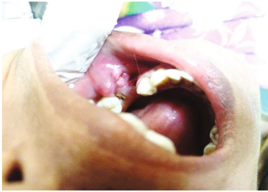
FIGURE 4: Clinical photograph showing nodular proliferous ulcerative growth measuring 3 × 2 centimetres on the alveolar mucosa.

never develop into oral cancer, similarly verrucous hyperplasia (VH) are often associated with papillomas or arise as a de novo lesion. VH (verrucous hyperplasia) and PVL (Proliferative Verrucous Leukoplakia) are irreversible clinicopathologic lesions with considerable potential for evolving into verrucous or squamous cell carcinoma. PVL is a disease of the oral cavity in which VH is a part of its developmental spectrum. Human papillomavirus, as a cofactor, may play an important role in some of these lesions [7, 8]; however, no signs suggestive of HPV infection were observed in the present histopathology section.