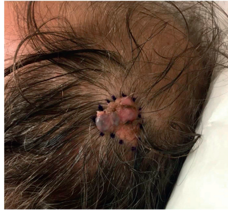
FIGURE 1: Clinical appearance of left parietal lesion at presentation to dermatology clinic.