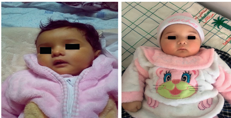
FIGURE 2: After 3 months of follow-up, the jaundice disappeared completely.

white blood cells were 12400/\text{mm}^3 , CRP was 18 \text{ mg/l} ( <6 ), and urine cytobacteriological examination showed a urinary tract infection with Klebsiella pneumoniae , and she had been treated successfully, but jaundice persisted.