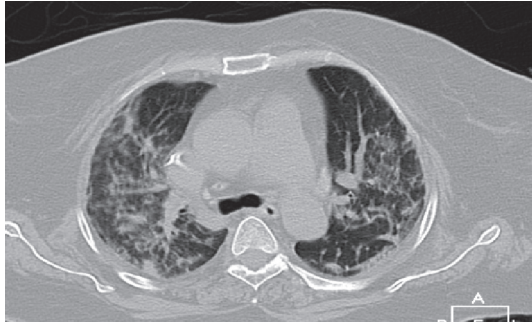
FIGURE 1: Chest computed tomography on admission showed multilobar ground-glass opacity with reticulation and consolidation in the center and periphery of both lungs.

also complained of cough, myalgia, and respiratory distress of three weeks' duration and reported dizziness and falling down 2 days before admission. She had no bladder symptoms of note.