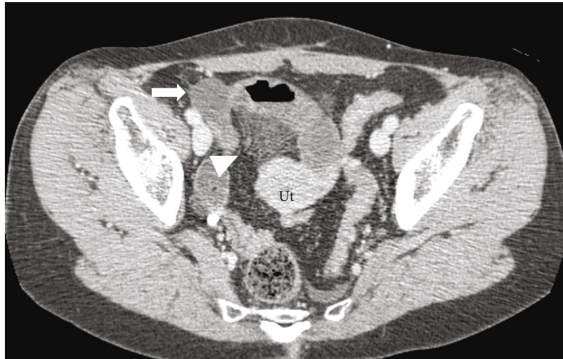
FIGURE 1: Contrast-enhanced computed tomography (CT) findings. The mesentery converges at the right side of the uterus (arrowhead). The uterus is deviated to the left. There is a spheroidal area of poor enhancement (arrow). Ut: uterus.