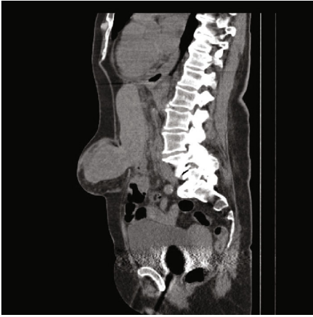
FIGURE 1: Sagittal section of noninjected CT abdominal scanner demonstrating herniation of liver segment III through the linea alba .