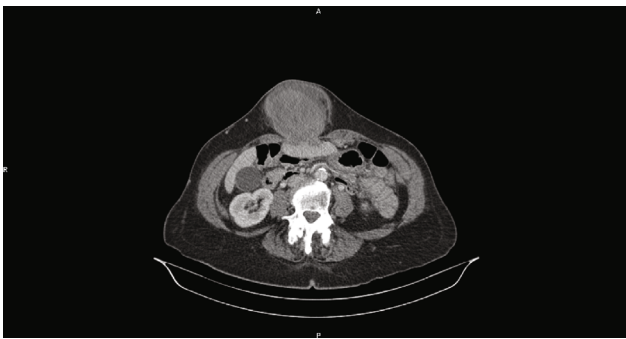
FIGURE 2: Axial section of injected CT abdominal scanner demonstrating herniation of liver segment III through the linea alba .

normal (Hb 13.3 g/dL), WBC count reached 20800/mm 3 with presence of a discrete inflammatory syndrome (CRP 47 mg/L), and hepatic cytolysis ranged twenty times the normal values (GOT 796 U/L, GPT 895 U/L, and LDH 671 U/L).