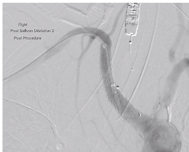
FIGURE 3: Completion DSA angiography demonstrating forward flow of contrast without extravasation through the Gore 16 × 10 × 70 mm iliac stent deployed in the ARSA.

The initial management priority is aggressive patient resuscitation, followed by attempted tamponade of the bleeding. Multiple authors describe temporary endoscopic control of bleeding with a Sengstaken-Blakemore tube or esophageal balloon. Endovascular approaches offer the possibility for