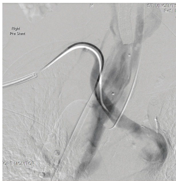
FIGURE 2: DSA angiography with oesophageal balloon deflated showing massive oesophageal haemorrhage from the ARSA.