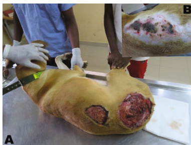
FIGURE 1: The patient on an examination bench. (a) Two large deep ulcers on the dorsum spanning the thoraco-lumbosacral region with cellulitis. (b) The dorsum of the thorax, after shaving, showing coalescing multifocal purple to black necrotic skin.