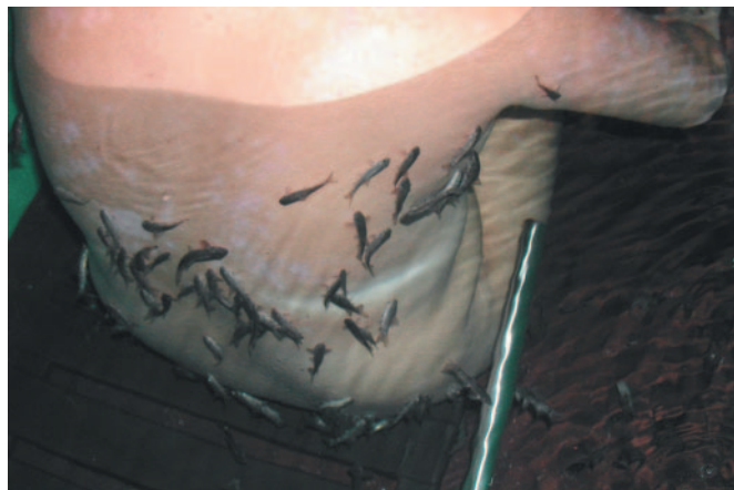
Figure 1. Patient sitting in standard treatment tub during therapy with the Kangal fish G. rufa .

skin scales of bathers, reportedly reducing illnesses such as psoriasis and atopic dermatitis (6).