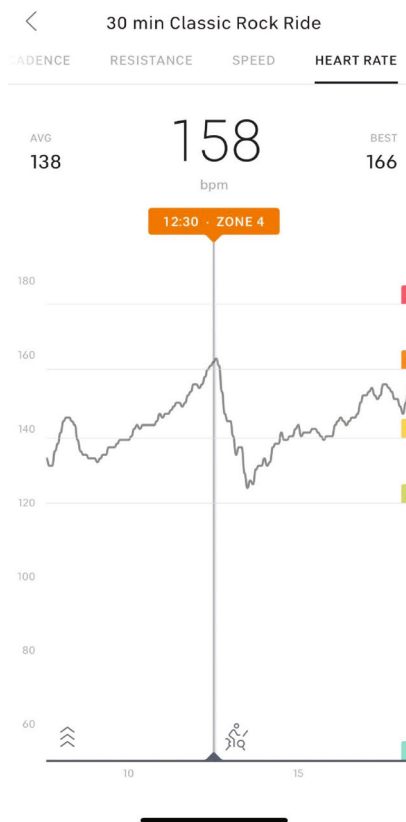
FIGURE 2: Example of heart rate data input from Bluetooth strap.

2.3. Analysis. We used SPSS v24.0 (IBM, Armonk, NY) for data analysis. Significance was set a priori at p \leq .05 . We expressed continuous variables as medians and interquartile range (IQR) and categorical variables as frequency and percentiles. Differences in baseline characteristics and demographics between the home PR group and hospital based seen in Table 1 were tested using a nonparametric testing which was a Chi square analysis for categorical variables and Mann-Whitney U analysis for continuous variables. We tested difference in our main outcome variable, the number of sessions completed, and our secondary outcome variable, total number of workouts performed, between the home-based PR and hospital-based PR using an independent t -test analysis. Frequency of program completion between groups was analyzed using the nonparametric test Chi-square analysis. We tested correlations between baseline characteristics and number of sessions completed in the home-based exercise group using a Spearman correlation. Changes in six-minute walk test and dyspnea scores between groups could not be tested due to large number of hospital-